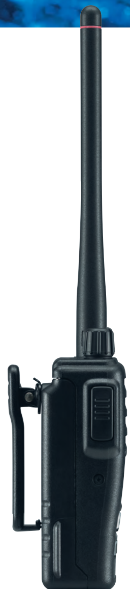
▼ IC-F51 ATEX