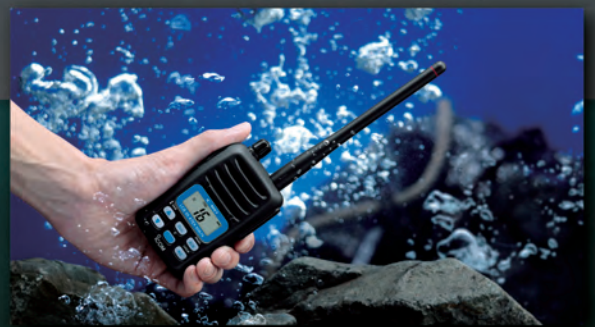
Photo includes optional speaker-microphone, HM-138.